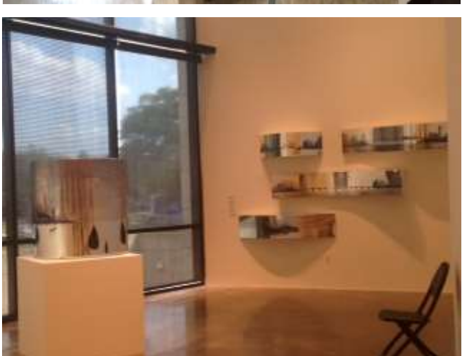
Vista general de la exhibición / Exhibit View