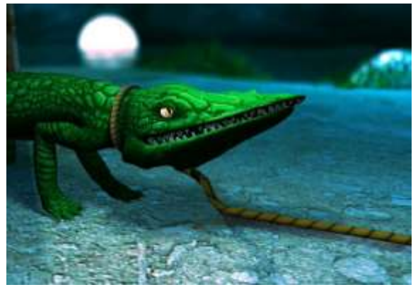
Sandra Ramos Domesticación. 3D Short Animation Video, 00:03:47 (2011)

"This initiative, conceived and foreseen by curator Caridad Blanco, reveals as its main signal, the immense expressive, technical and broad plurality of the 160 artworks exhibited.