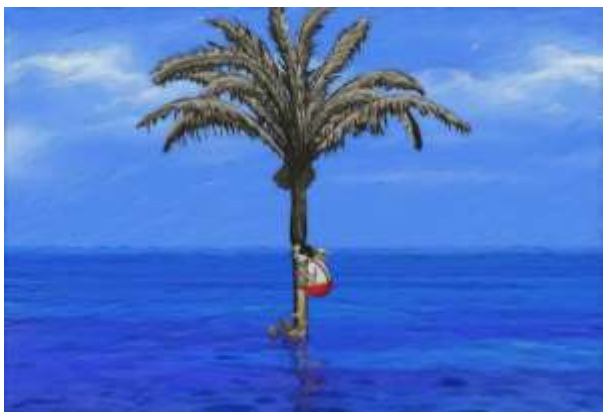
Sandra Ramos Escape. 3D Short Animation Video, 00:02:57 (2009)