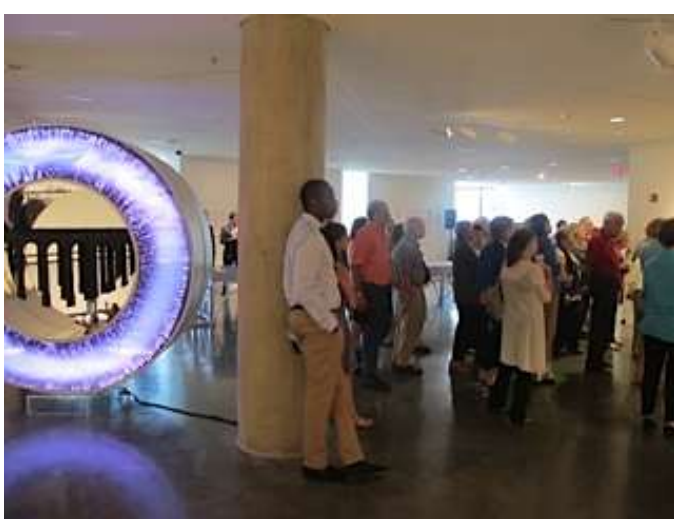
Vista general de la exhibición / Exhibit View