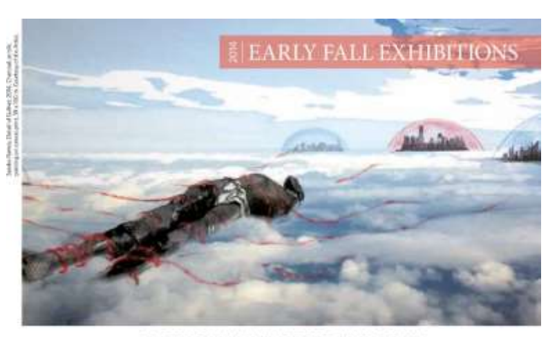
AMERICAN UNIVERSITY MUSEUM AT THE KATZEN ARTS CENTER