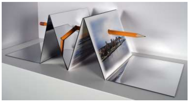
SANDRA RAMOS Searching Ithaca 2015. Artist Book. Print on paper/ mirror Plexiglas. 24 \times 54 \times 18 inches Edition /3+ a/p

Image: Sandra Ramos, Aquarium, 2013. Still from video animation.