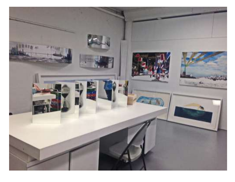
SANDRA RAMOS Studio Views