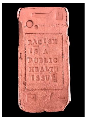
SANDRA RAMOS. Impossible Dialogue: American disputes, 2021