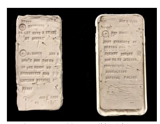
SANDRA RAMOS. Impossible Dialogue: American disputes, 2021