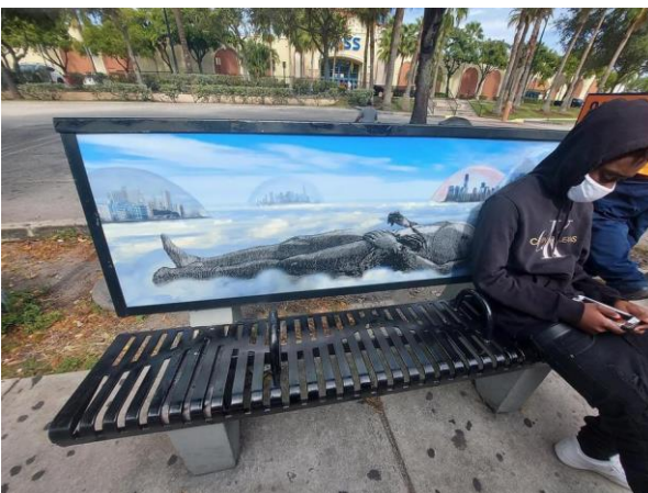
SANDRA RAMOS. Homeless Bench. Digital print. 2021