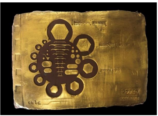
SANDRA RAMOS. Impossible Dialogue: Cuban debates, COVID. 2021