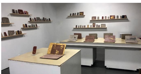
SANDRA RAMOS. Impossible Dialogue. Installation, clay, plastic, furniture and video. 2021.