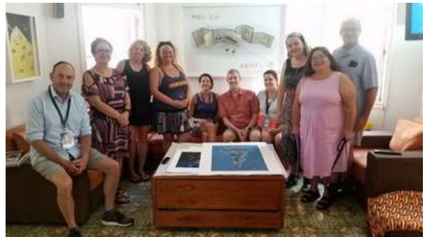
Sonoma Valley Museum of Art