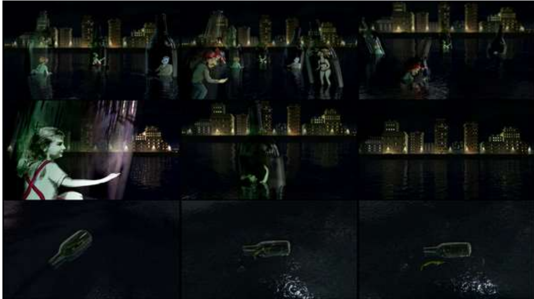
SANDRA RAMOS: Naufragio/ Shipwreck , 2008 (00:02:46) AT THE EXHIBIT: Video Show. Selection from the International Video art Camagüey Festival (FIVAC). CULPABLES POR PELIGROSOS. Centro Hispanoamericano de Cultura, La Habana. April 16th / 2:00pm.