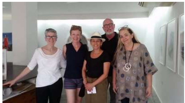
Frost Museum of Art