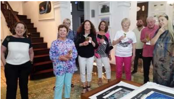
Friends from Cubapuentes Inc.