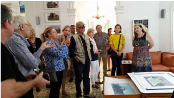
Panamerican Art Gallery, Miami