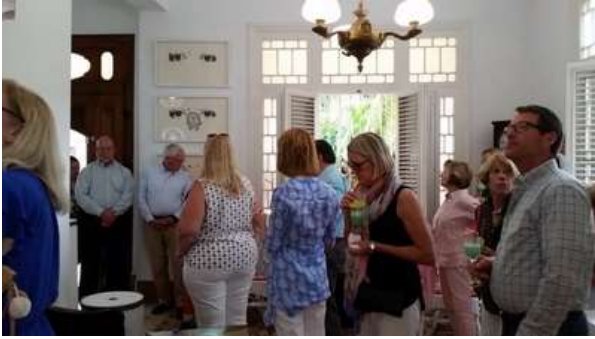
Museum Travel Alliance

Sponsored by Montclair Art Museum, Newport Art Museum and Museum Travel Alliance. Havana Heritage Foundation