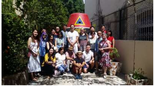
YPO Group, Young Business Man from Malasia

Sponsored by Montclair Art Museum, Newport Art Museum and Museum Travel Alliance. Havana Heritage Foundation