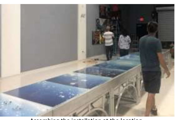
Assembing the installation at the location.