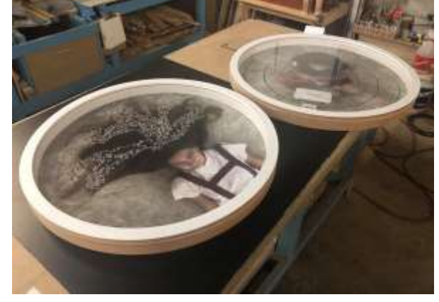
SANDRA RAMOS Untitled, 2018 Ensemble, wood, acrylic, charcoal Courtesy of the artist