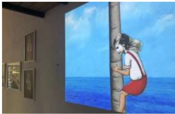
SANDRA RAMOS General view of the exhibition