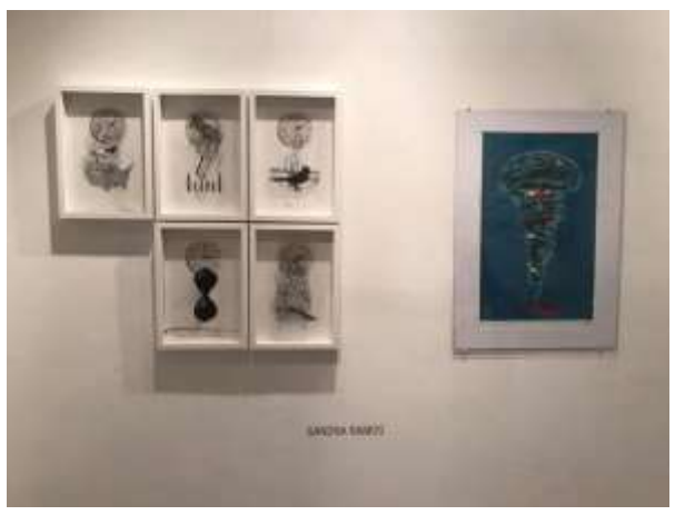
SANDRA RAMOS (left) Lost time Series, 2016 Drawing, mix media & engraving on acrylic sheet. (right) Tornado, 2009 Etching & Aquatint