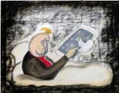
SANDRA RAMOS Trumpito. (Nightmare), 2018. Oil/ canvas