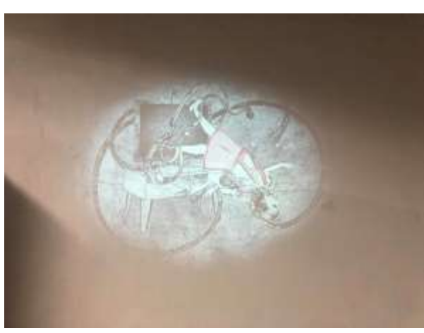
SANDRA RAMOS Two Islands Fighting, 2018 3D short animation

Open Studios & Baker's Brunch. Studio 54 / Bakehouse Art Complex / 561 NW 32nd Street, Miami FL 33127. Thursday, December 6, 9am-12pm